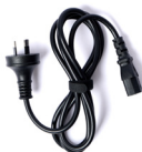
Mains Power Cord