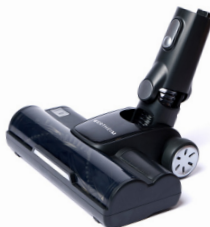
Carpet Brush with White Dirt Finder Light