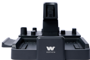
Charging And Cleaning Base