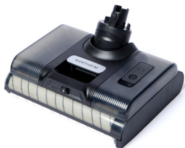
Dual Roller Wet Cleaning Brush with Green Dirt Finder Light