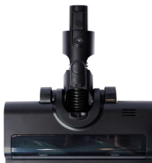
Motorised Low Profile Cleaning Head