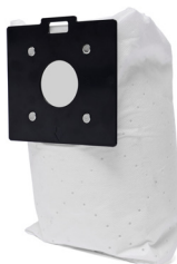
Synthetic material dust bag x 2